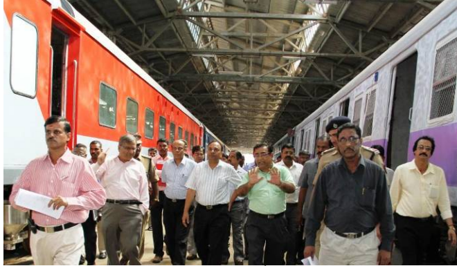
GM visited Shell factory on 23 rd Nov, Fur & LHB shed on 26 th , RRM and D&D on 28 th Nov.