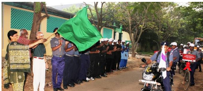
AIDS awareness cycle rally from ICF to Chengalpattu was organized by Scouts & Guides.