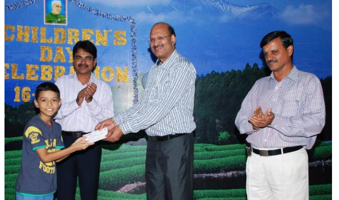
Children's day was celebrated at Integral club with cultural, sports and competitions on 16 th Nov.