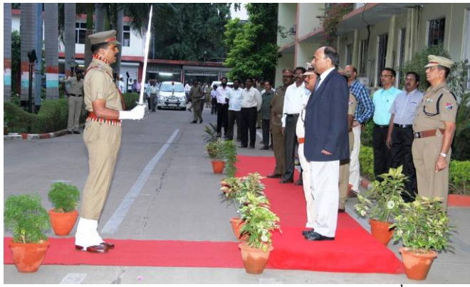
Guard of Honour to GM/ICF by RPF on 22 nd Nov.