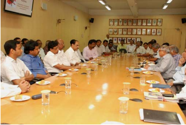
GM and officers at the meeting with Ambattur Industrial Estate Manufacturers' Association held on 3 rd Jan to improve the supply of trade items.