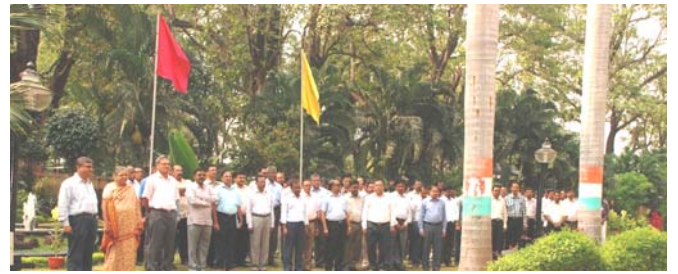
Martyrs' Day was observed on 30th Jan with two minutes silence at all offices and shops of ICF.

➤ Pongal Day was celebrated by the officers with spouse at Officers' Club on 25 th Jan, organized by ICFWWO.