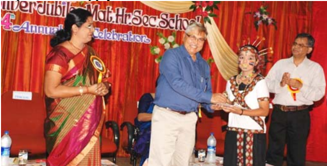
Annual Day of ICF SJ School was held on 24 th Jan in which GM participated as Chief Guest.