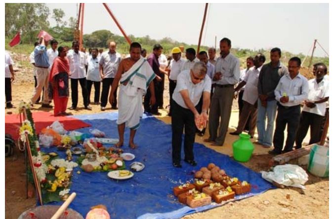
Bhoomi Pooja for ICF Unit II was held on 21 st April.

We wish them A HAPPY AND PEACEFUL RETIRED LIFE.