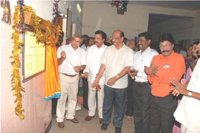
Ayurvedic clinic was opened at ICF hospital by GM on 17 th Sep. The clinic will function from 1400 to 1730 hrs on all working days except Sundays and holidays.