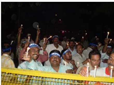
A portion of procession at Parliament Street on 21.04.2008