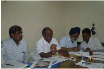
Coordination meeting with AIREF at New Delhi