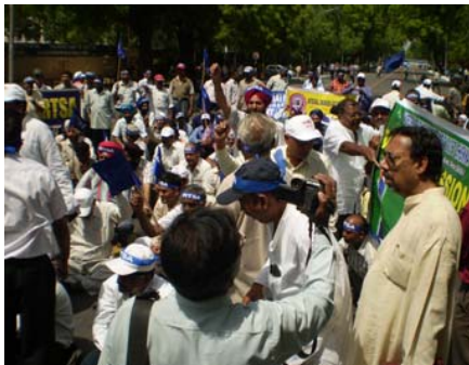
Protest at Parliament Street