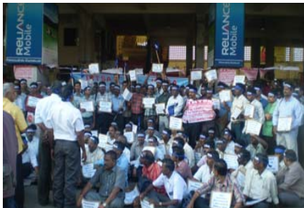
Protest in front of Chennai Central Station