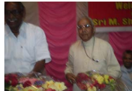
Patron & CP greeted