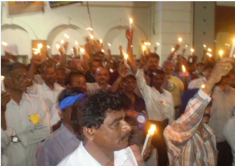
Mid Night Candle Light Agitation in Front of Trichy Junction on 07.03.2008

ACTIONS ARE BORN OUT OF THE COMBINED STRENGTH OF MAN POWER AND MONETARY STRENGTH.